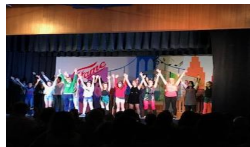
The Musical FAME