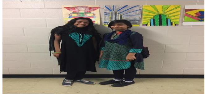
Asian Spirit Day

Staff and Students at Homelands celebrated Asian History in creative and engaging ways throughout the month of May. In many classrooms, students were learning about the economic, cultural and social contributions of Asian-Canadians in shaping Canada's development. A variety of Asian inspired activities were organized such as Asian Spirit Day, Henna & Origami workshops, Rangoli chalk drawings. All of these activities were free and provided students with unique, new learning experiences. A beautiful dance performance choreographed by Ms. Madray kicked off our celebration and a Dumpling Demo Cooking Session is scheduled to close out Asian Heritage month. Thanks to ALL who participated and helped out with organizing the events. Looking forward to next year's celebrations:)