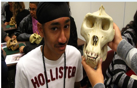
Examining our ancestors at the ROM